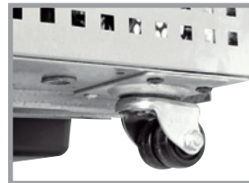
1 1/2" diameter dual swivel castors for "LP" models.