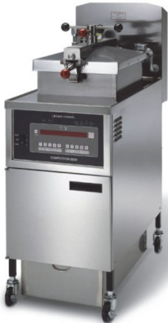
PFG 600 gas pressure fryer with Computron™ 8000 control

Henny Penny first introduced commercial pressure frying to the foodservice industry more than 50 years ago. Frying under pressure enables lower cooking temperatures for longer oil life, and faster cooking times to meet peak demand. Pressure also seals in food's natural juices and reduces the amount of oil absorbed into product.