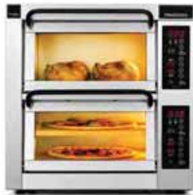
Model shown: PM 402ED-1