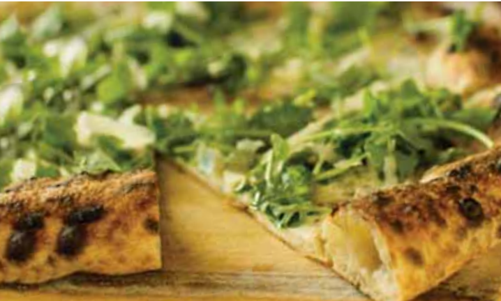
for True Artisan Pizza