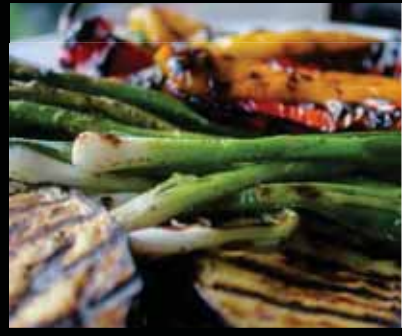
for Genuine MultiCooking