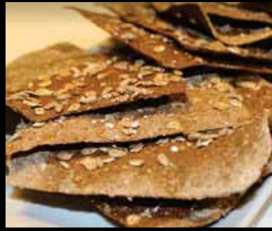
for High Temperature Baking