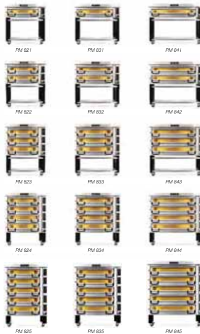
PM 800 Series