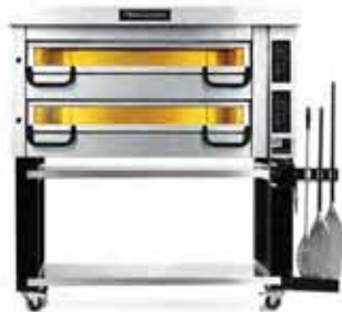
Model shown: PM 732ED, including optional equipment