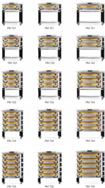
PM 700 Series