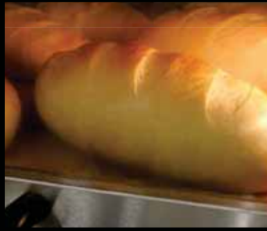
for Tastier Bread and Pastries