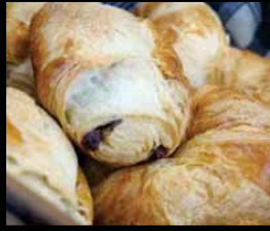
for Tastier Bread and Pastries