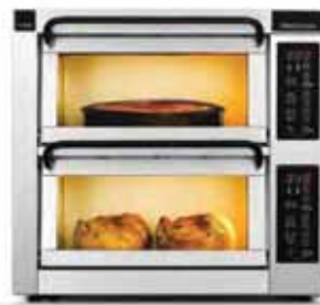
Model shown: PM 452ED