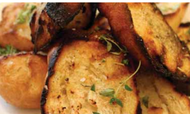
for Genuine MultiCooking

This can be crispy and shiny baguettes as well as any other type of bread like, traditional German or Mediterranean Bread, Italian delicacies like Ciabatta and Focaccia, Pastries like Croissant and Danish or local specialties like baklava. This is just a few examples of bread and pastries that can be baked in our ovens.