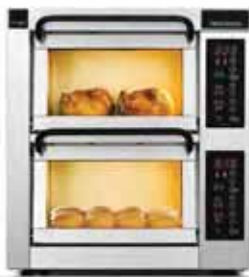
Model shown: PM 352ED