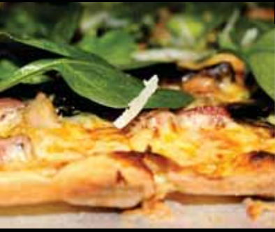
for True Artisan Pizza