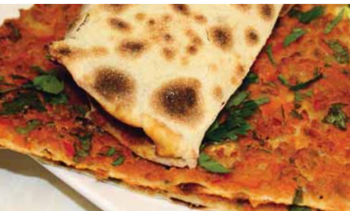
for High Temperature Baking

Our passion strive us to always deepen and keep our knowledge up to date for – the production and the characteristics of the flour, how to process the dough, the origins and quality of the toppings, of course taking in consideration the habits, tastes and availability of different countries – We deliver all this passion and knowledge into our ovens to make them the very best tool available for making all types of pizza better for everyone to enjoy.