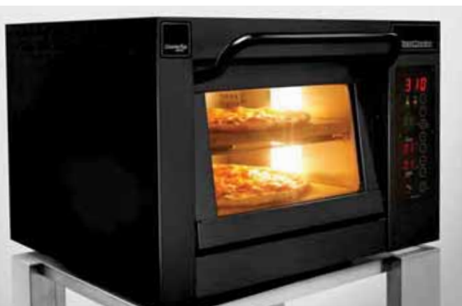
PM 351ED-1 made in Phantom Black