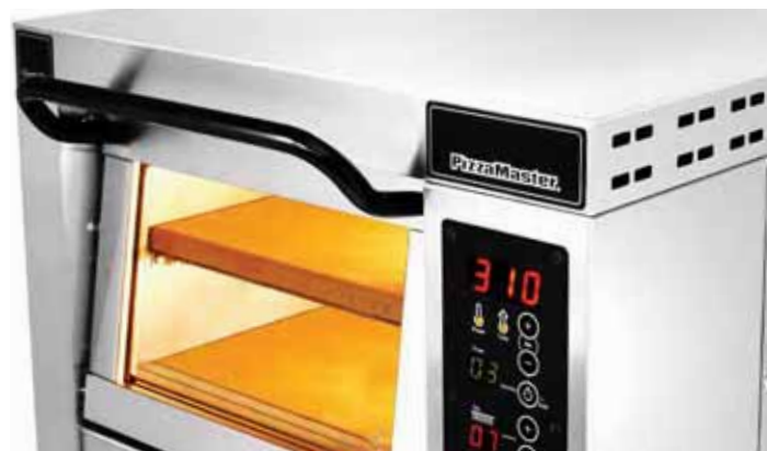
Sleek, brushed stainless-steel surfaces, virtually seamless joints and no visible screws or rivets make the oven very smart and easy to clean.