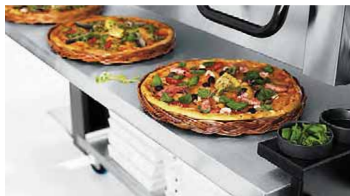
Retractable frontal unloading shelf lets you make or save space quickly and easily