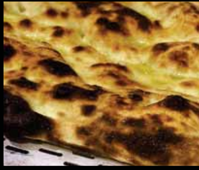
for High Temperature Baking