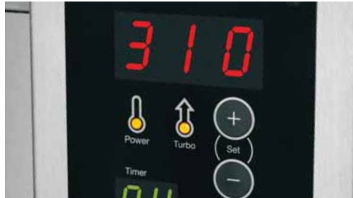
The stepless electronic controls, turbo-start function and digital display are logical and easy to use.

This beauty also has functions. It conceals a unique and effective spatial insulation concept, improves the environment, interfaces perfectly with the user and makes it very easy to clean the oven. It reflects the quality that runs right to the heart of every PizzaMaster® oven, where performance is what matters. In this respect, the oven is engineered to do exactly what we promise, enabling you to deliver professional results in every situation where convenience is essential and quality is paramount.