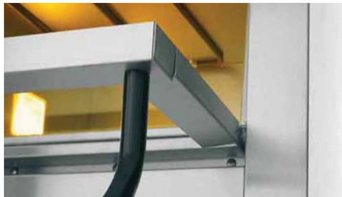
A big strong door with ergonomic handle and large window enables easy loading, inspection and unloading. Halogen lights complete the picture.