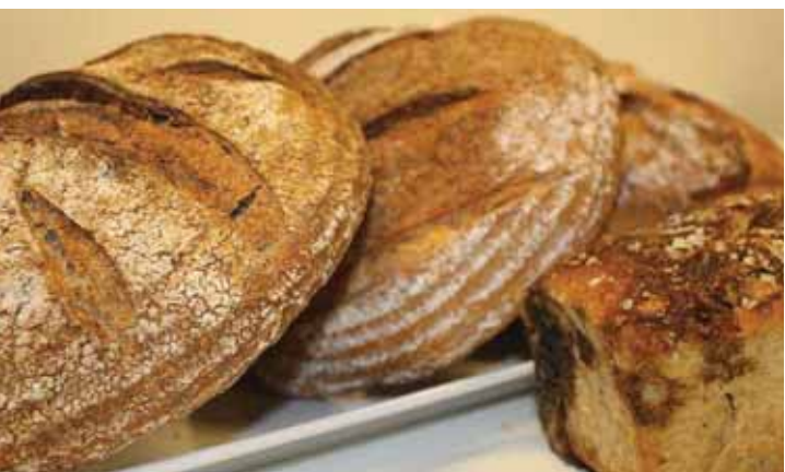
for Tastier Bread and Pastries