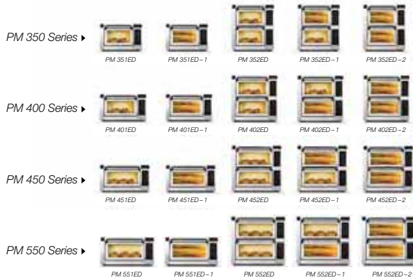
CounterTop Series Standard Width