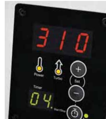
Digital or classic control panel - both logical and easy to use