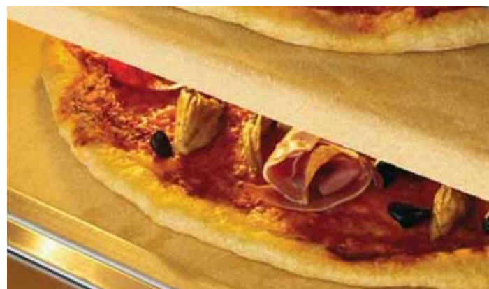
Each oven chamber can be divided easily into two decks by fitting an intermediate hearthstone and element, which doubles the oven capacity.