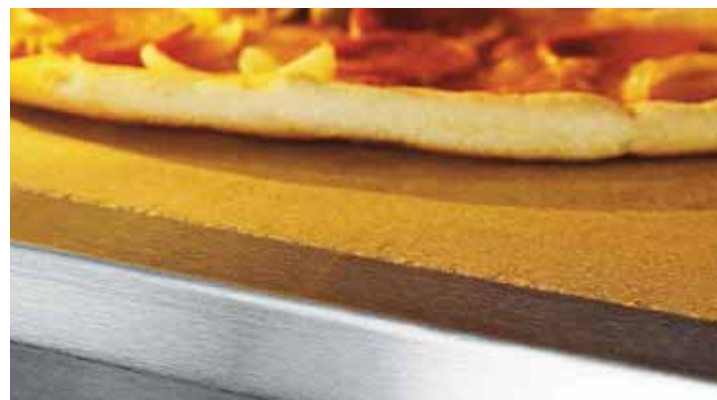
Hearth of natural material, with crisping function for perfect texture and flavour