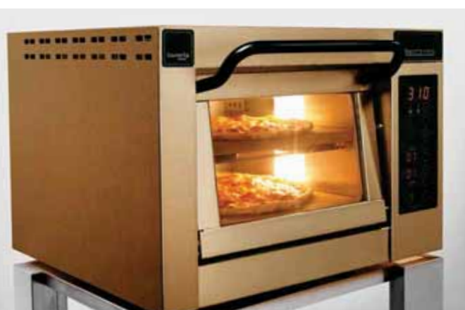
PM 351ED-1 made in Royal Gold