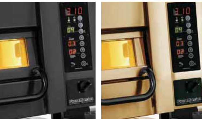
Phantom Black or Royal Gold polished stainless steel