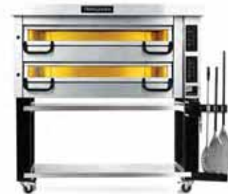
Model shown: PM 932ED, including optional equipment