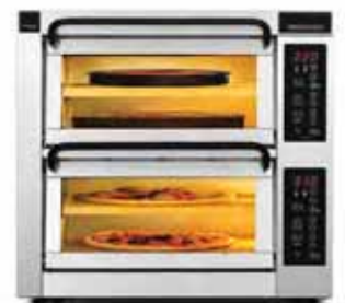
Model shown: PM 552ED-2