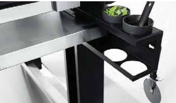
Oil - and spice rack for final touch