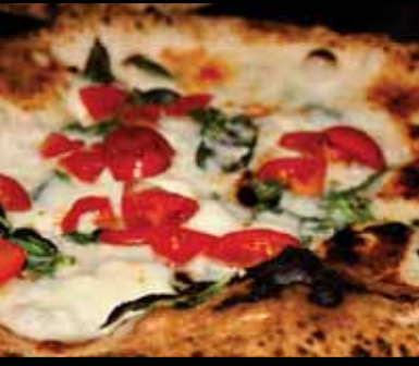
for True Artisan Pizza