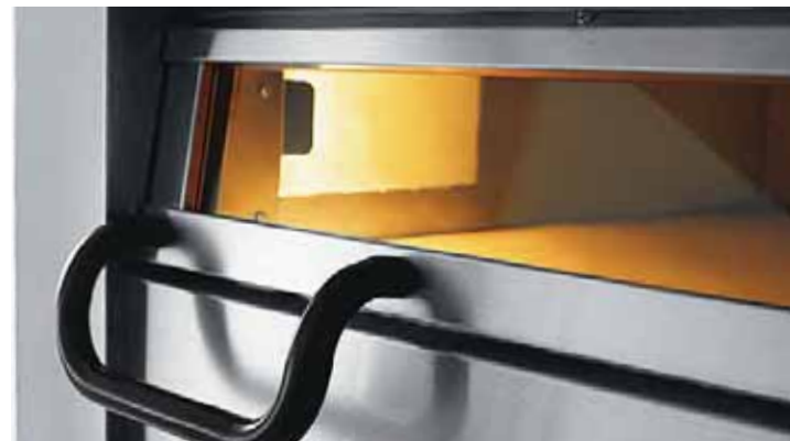
Robust, smoothly-opening door with large window and ergonomic handles