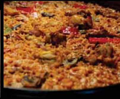
for Genuine MultiCooking